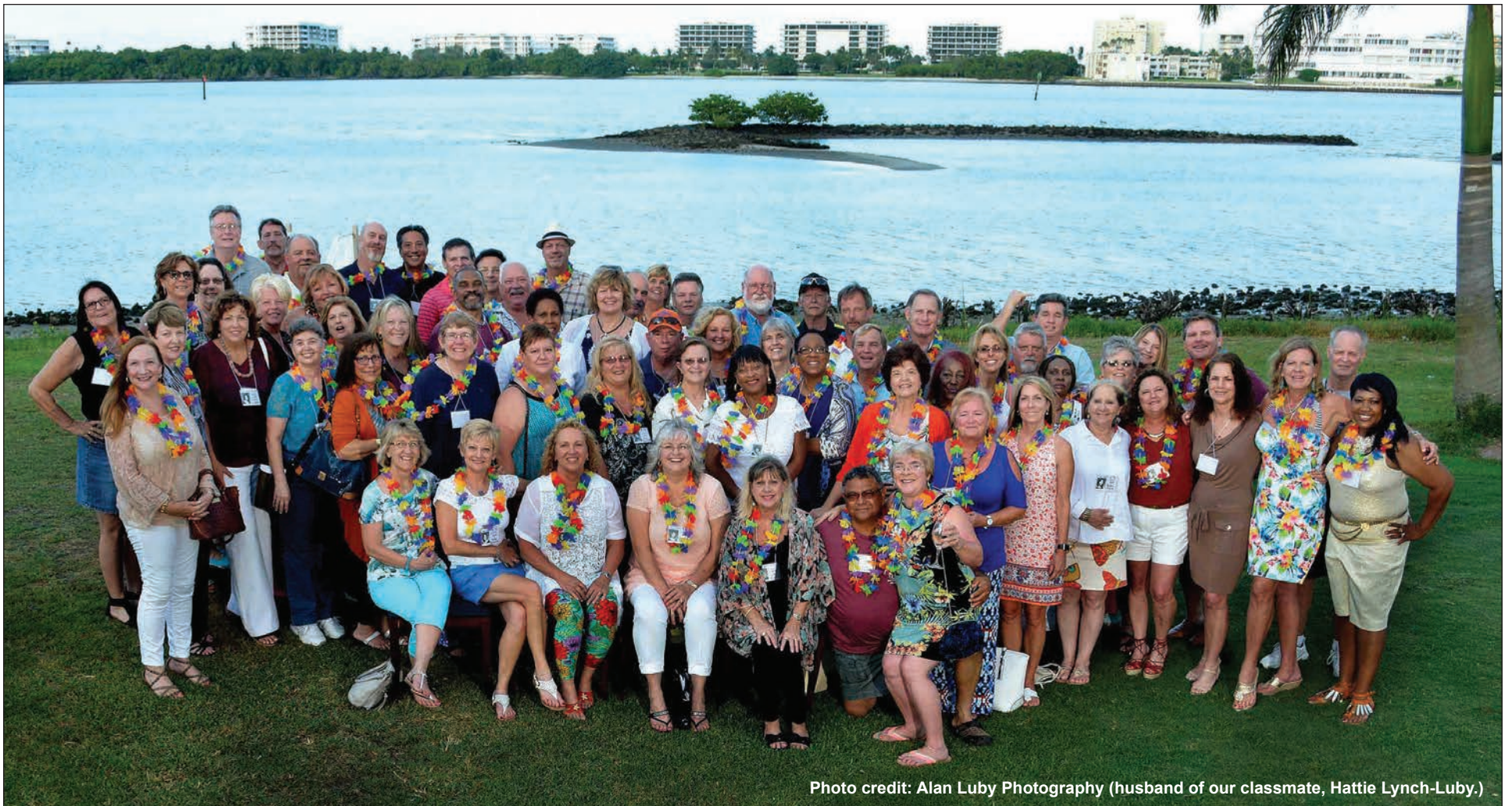
Photo credit: Alan Luby Photography (husband of our classmate, Hattie Lynch-Luby.)