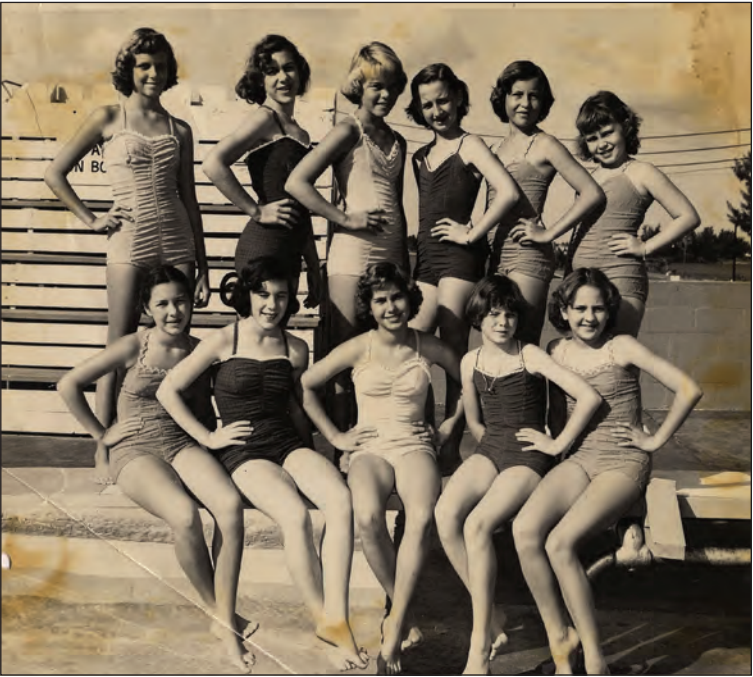
The LWHS girls' swim team approximately 1958 or 1959. "Who are these pretty girls?"