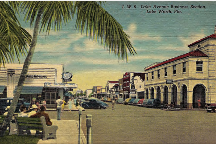
The corner of Lake Avenue and Dixie Hwy. with the Ideal Drug Store to the left.