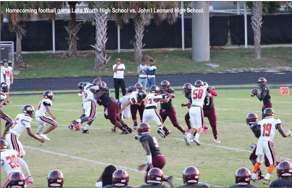
Homecoming football game Lake Worth High School vs. John I Leonard High School.

At the present time I volunteer with a group that provides free tax preparation and filing for almost anyone interested in our assistance. I have recently been nominated to serve a 6 year appointment (isn't that optimistic!) to serve on a behavioral health board that oversees mental health for two counties in northern Alabama. Whether the appointment happens or not, does not diminish the lessons I learned in those formative teenage years at LWHS.