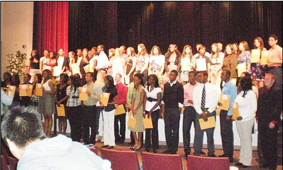
2010 DFS Scholarship recipients on stage May 5th awards ceremony in Tommy Hansen Hall. See President’s Message on page 8.