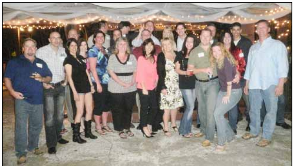
Class of 84 Reunion Dinner at the Bonnet Hunting Lodge, West Palm Beach