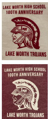
Detail of front design