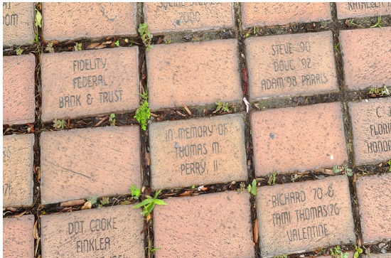
Here's where your brick could be. Above: A section of the installed bricks. Left, a closeup of memories. Below: The bricks are nestled in sections by the auditorium. The new price of bricks includes the installation costs.