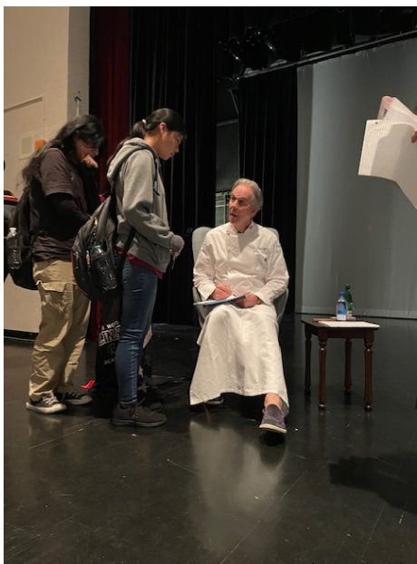
Thomas Keller signed autographs while chatting with students.