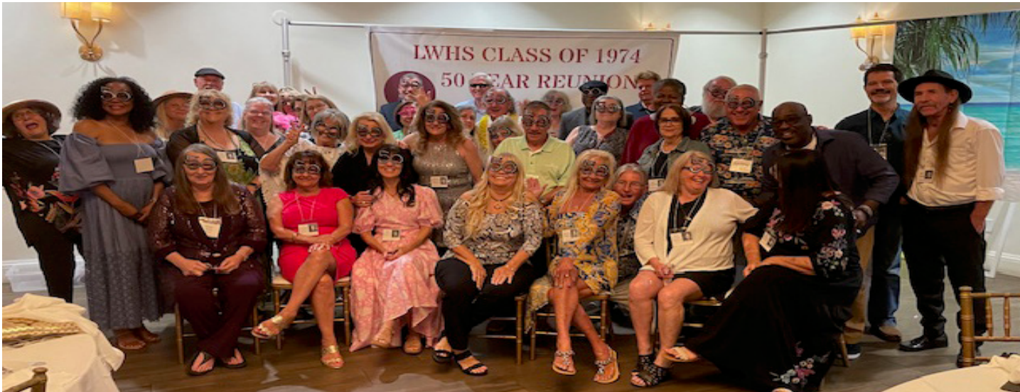
The rowdy crowd settled down to record the occasion for posterity.