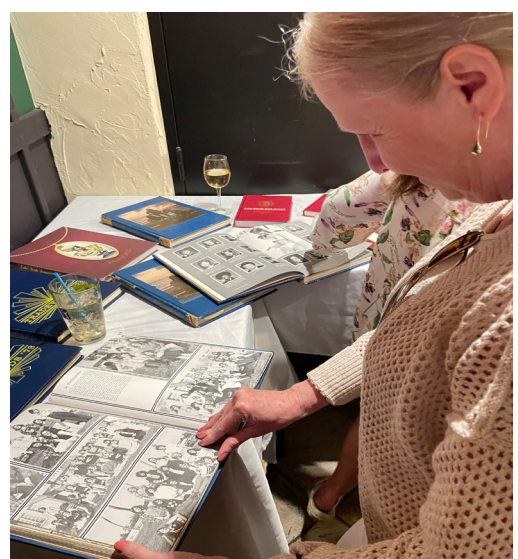
Left photo: A group of friends catch up at the dinner-dance. Above photo: Old yearbooks get the attention of one former student.