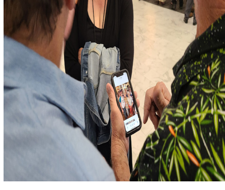
Smart phones are part of the celebration.

Above: A couple of classmates check out the photo just taken. Right photo: An alumnus catches the action in the packed-to-overflowing room at Irish Brigade on Friday.