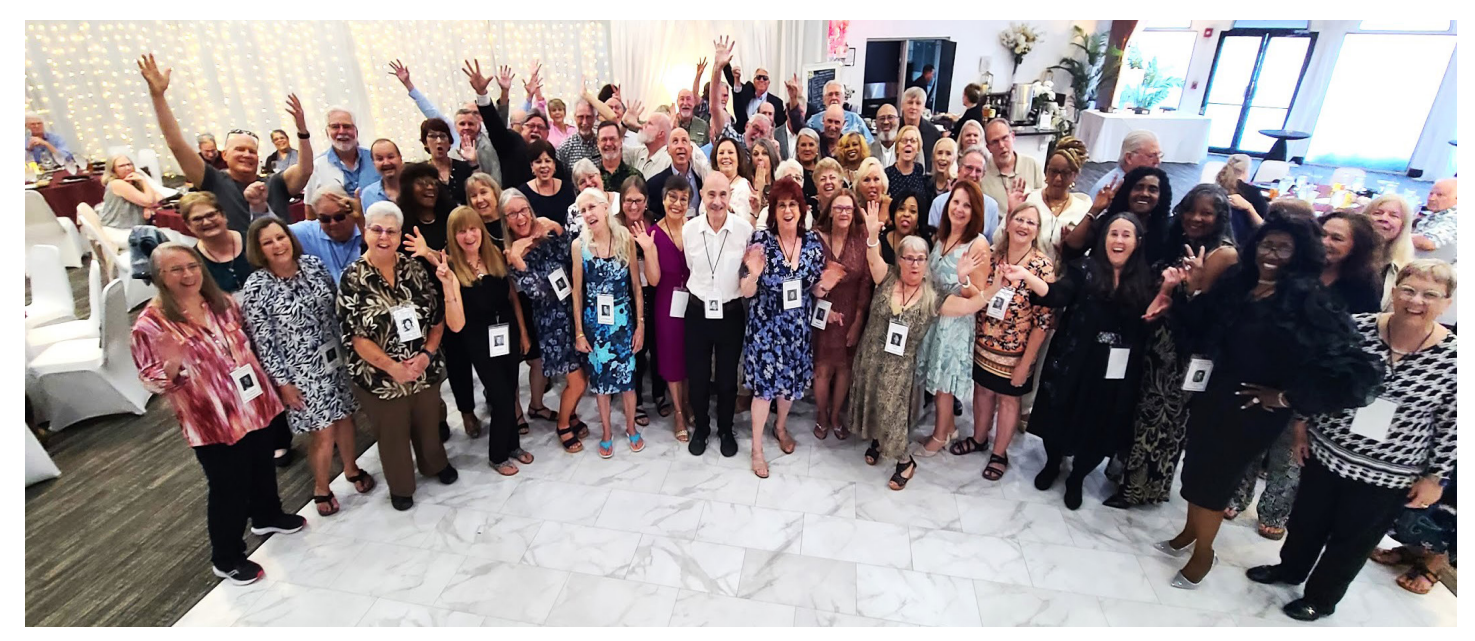
Members of the class of 1975 demonstrate that, while it may have been 50 years, they're doing fine.