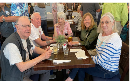
The party kicked off on Friday night with hors d'oeuvres and drinks at the Beach Club on the Municipal Golf Course in Lake Worth. Lots of memories, lots of smiles.